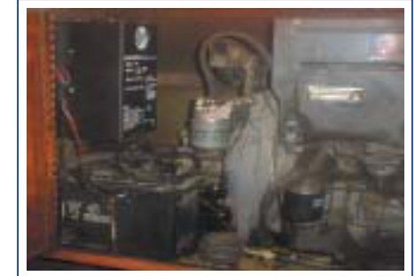
Installation on sky-lift